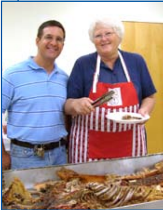
Saturday workers enjoyed a roasted pig meal.