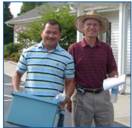
"Seed Sowers" take to the streets in Jacksonville North Carolina

A good crowd of workers gather on Saturday from Maranatha Baptist Church and Grace Baptist Church to enjoy a noon meal.